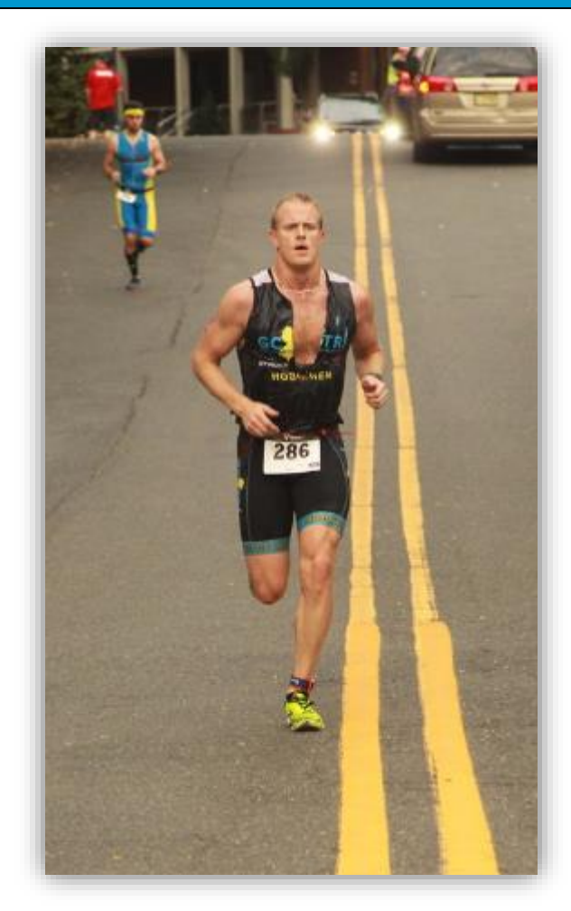
Outside of triathlon, how else do you enjoy spending your free time?

I try to do most of my training in the mornings before work. Sometimes getting up as early as 4 depending on early morning work meetings or travel. Other than that - being flexible with scheduling and laying out plans with family and friends as much in advance as possible makes training much easier. I spend a lot of time on the indoor trainer for bike intervals, it has paid enormous dividends this year. I can get the same amount of work on the trainer in less time than outside which helps when the window to train is small.